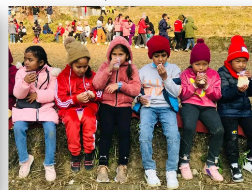
Christmas #kids fun and Picnic